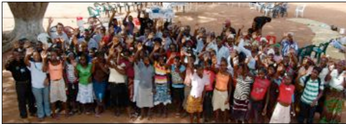
MEPM GIRLS AND THEIR PARENTS WELCOMING THE START OF THE PROGRAM'S SECOND YEAR. BECAUSE OF LMF AND THEIR OWN DETERMINATION, THESE 40 GIRLS WILL HAVE THE CHANCE TO CONTINUE THEIR SECONDARY SCHOOL EDUCATION.

On January 28, 2009, LMF officially launched Year 2 for the Mais Escola Para Mim (MEpM) scholarship program in Magude. The young participants, their parents, LMF staff members and Magude educational officials were all in attendance to celebrate the occasion and look ahead to a year of hard work and self-improvement.